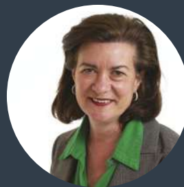
Eluned Morgan, First Minister of Wales.

I encourage you to explore everything Wales has to offer as a filming location, and we look forward to extending a warm, Welsh welcome to you very soon.