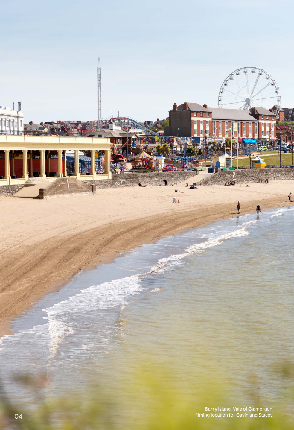
Barry Island, Vale of Glamorgan, filming location for Gavin and Stacey.