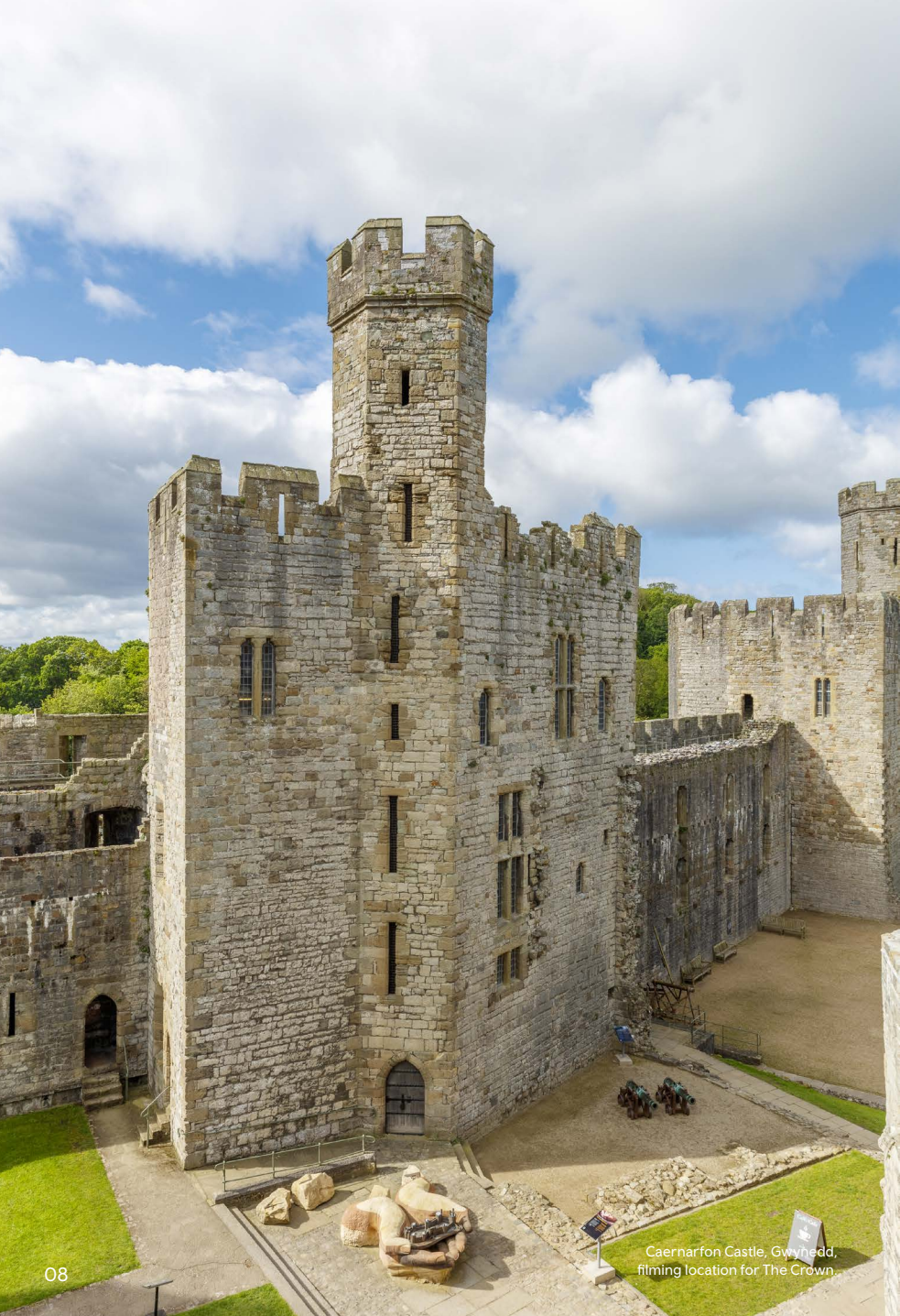
Caernarfon Castle, Gwynedd, filming location for The Crown .